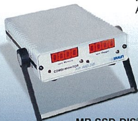
MB SSD-DIS ® Analyzer system