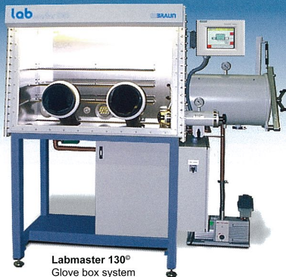
Labmaster 130 ® Glove box system