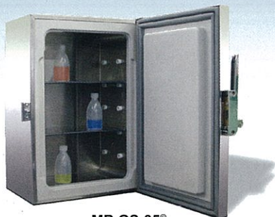
MB GS-35 ® Refrigerator