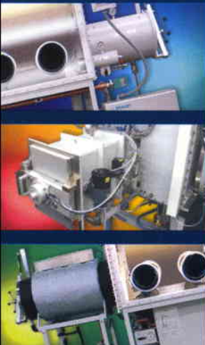
dry room section