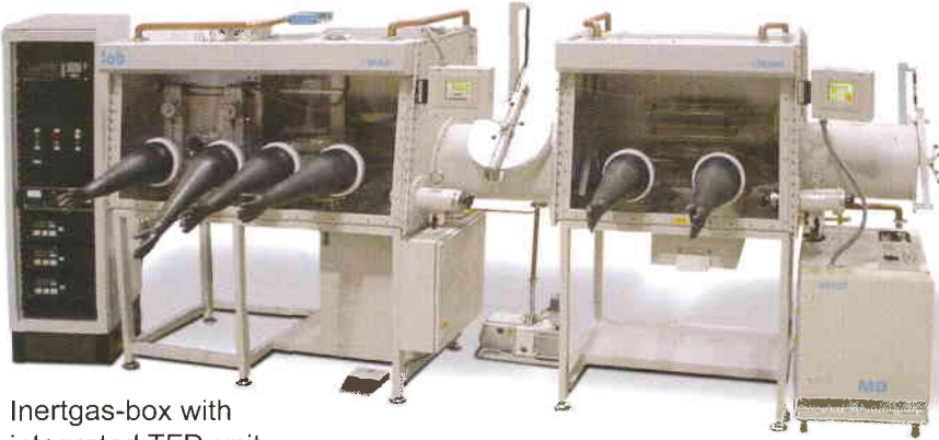
Inertgas-box with integrated TFD-unit

MBRAUN technology for research & development