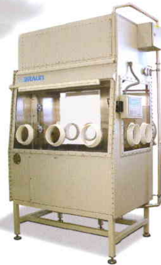
Laminar-flow Removal of Moisture, Oxygen and particles