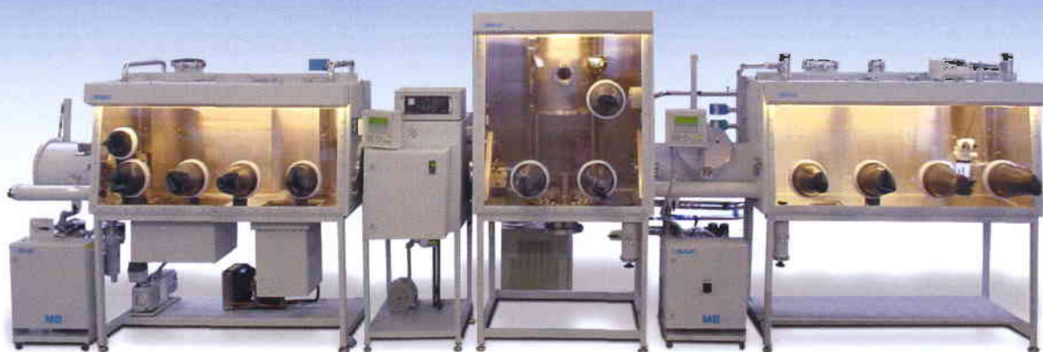
OLED-system (Organic Light Emitting Diodes)