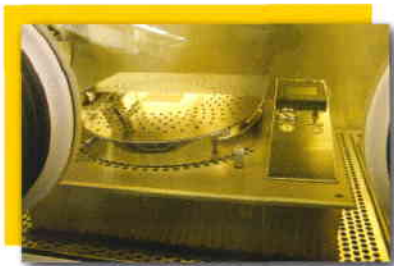
Hot plate drying