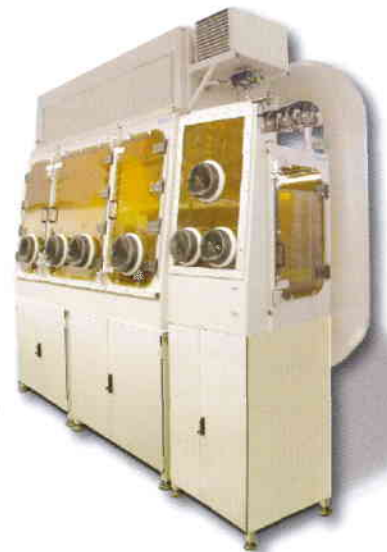
Inertgas-box with integrated ink jet machine