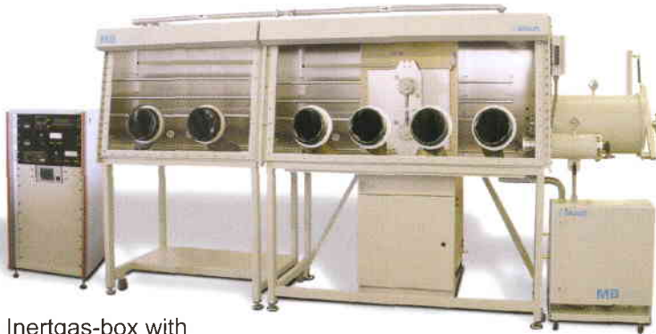
Inertgas-box with integrated TFD-unit